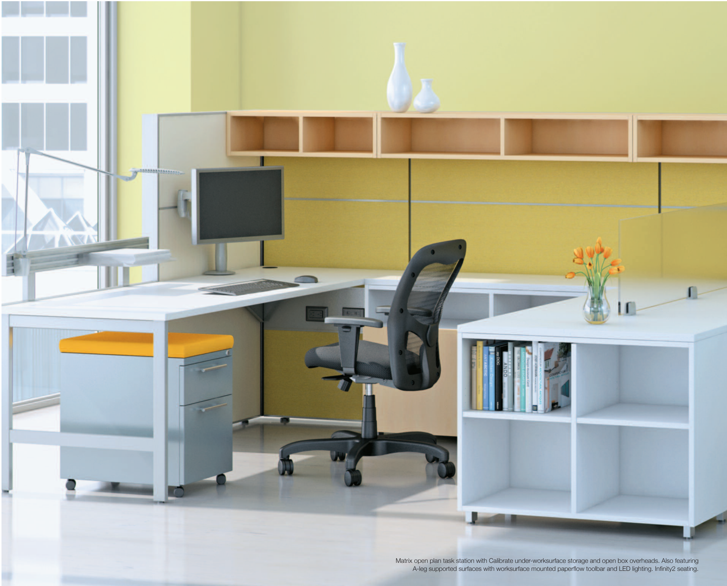
Matrix open plan task station with Calibrate under-worksurface storage and open box overheads. Also featuring A-leg supported surfaces with worksurface mounted paperflow toolbar and LED lighting. Infinity2 seating.

When coupled with Calibrate components and accessories, work areas become collaborative and modern with a twist of elegance. With virtually limitless options, Matrix can bring your office space to a new level of sophistication.