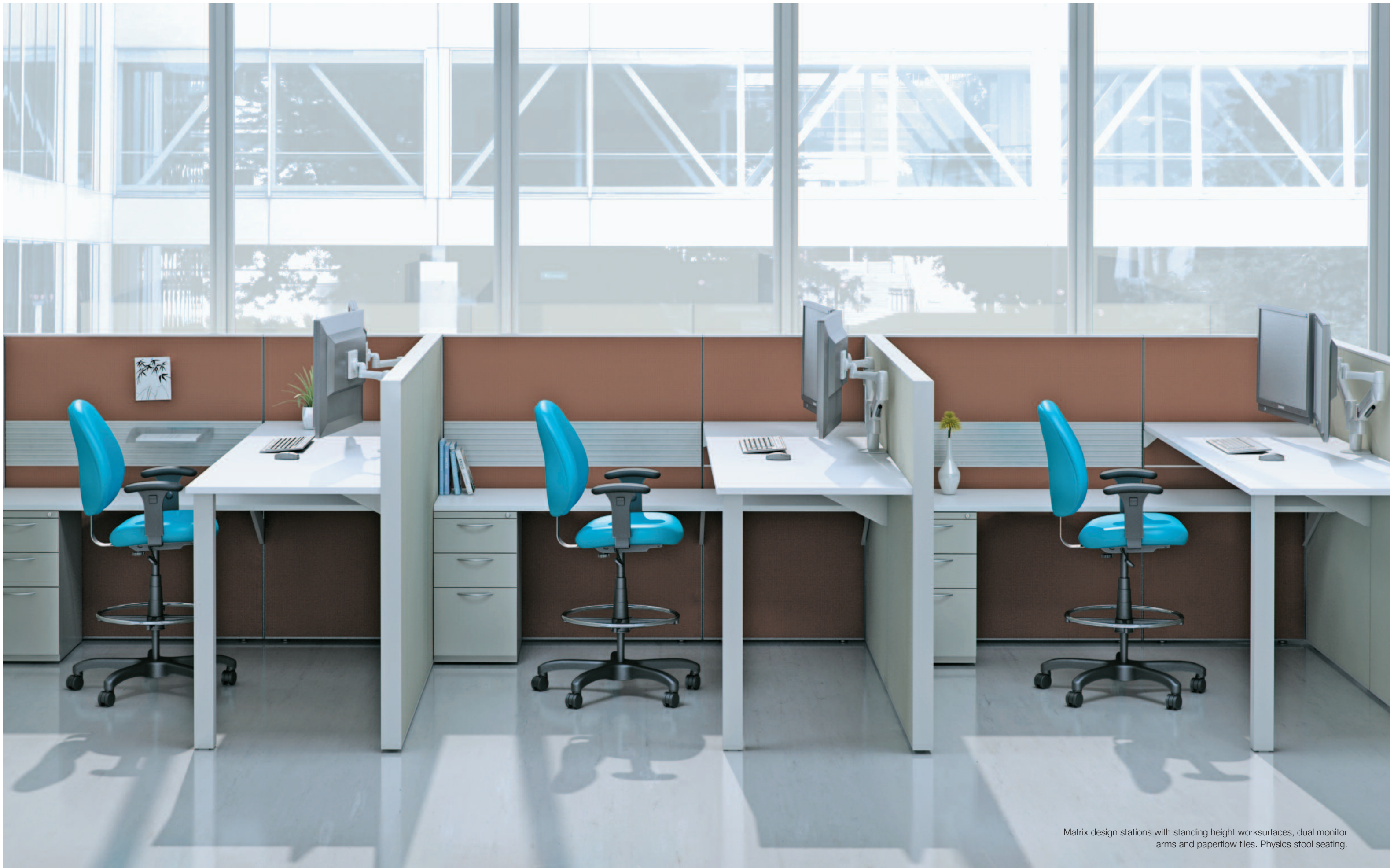
Matrix design stations with standing height worksurfaces, dual monitor arms and paperflow tiles. Physics stool seating.