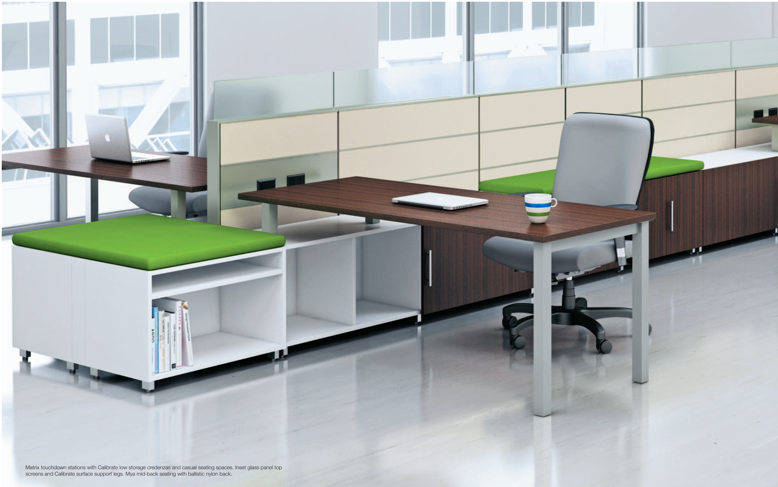
Matrix touchdown stations with Calibrate low storage credenzas and casual seating spaces. Inset glass panel top screens and Calibrate surface support legs. Mya mid-back seating with ballistic nylon back.