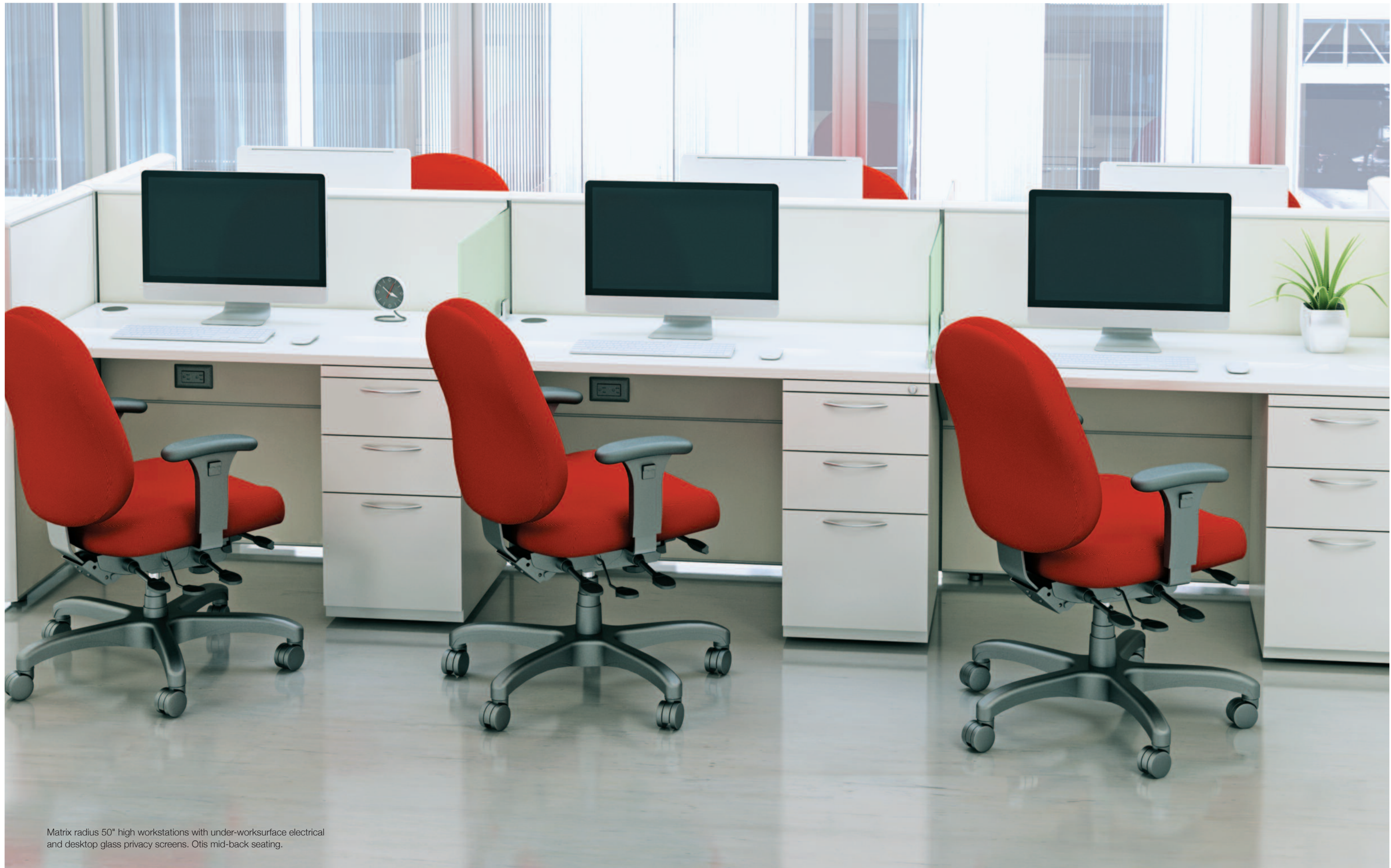
Matrix radius 50" high workstations with under-worksurface electrical and desktop glass privacy screens. Otis mid-back seating.