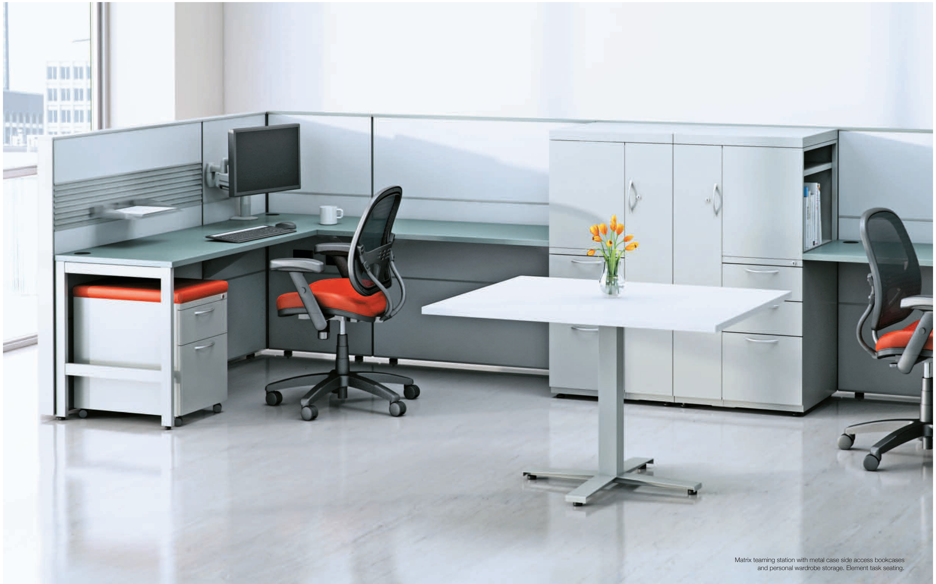
Matrix teaming station with metal case side access bookcases and personal wardrobe storage. Element task seating.