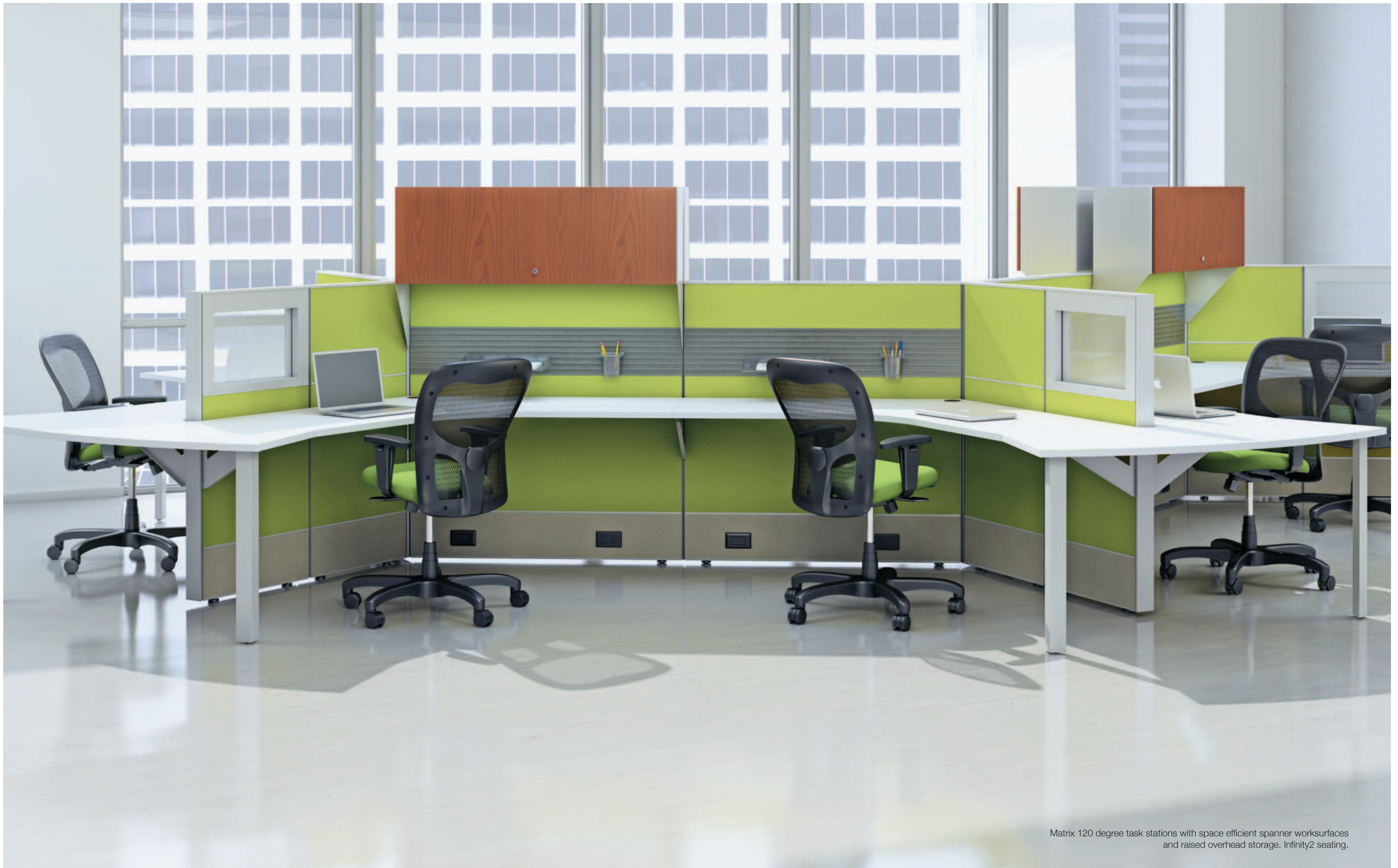
Matrix 120 degree task stations with space efficient spanner worksurfaces and raised overhead storage. Infinity2 seating.