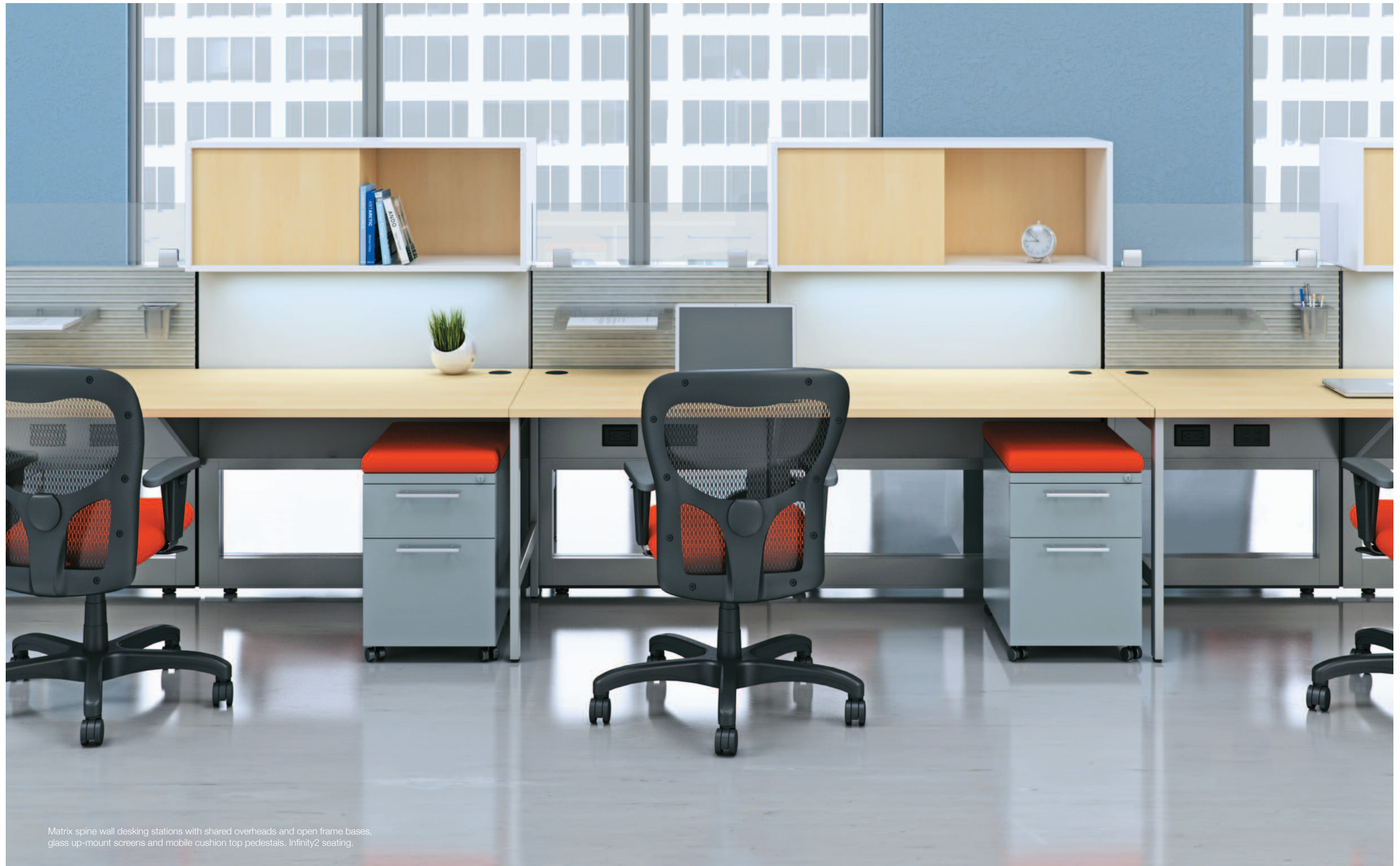
Matrix spine wall desking stations with shared overheads and open frame bases, glass up-mount screens and mobile cushion top pedestals. Infinity2 seating.