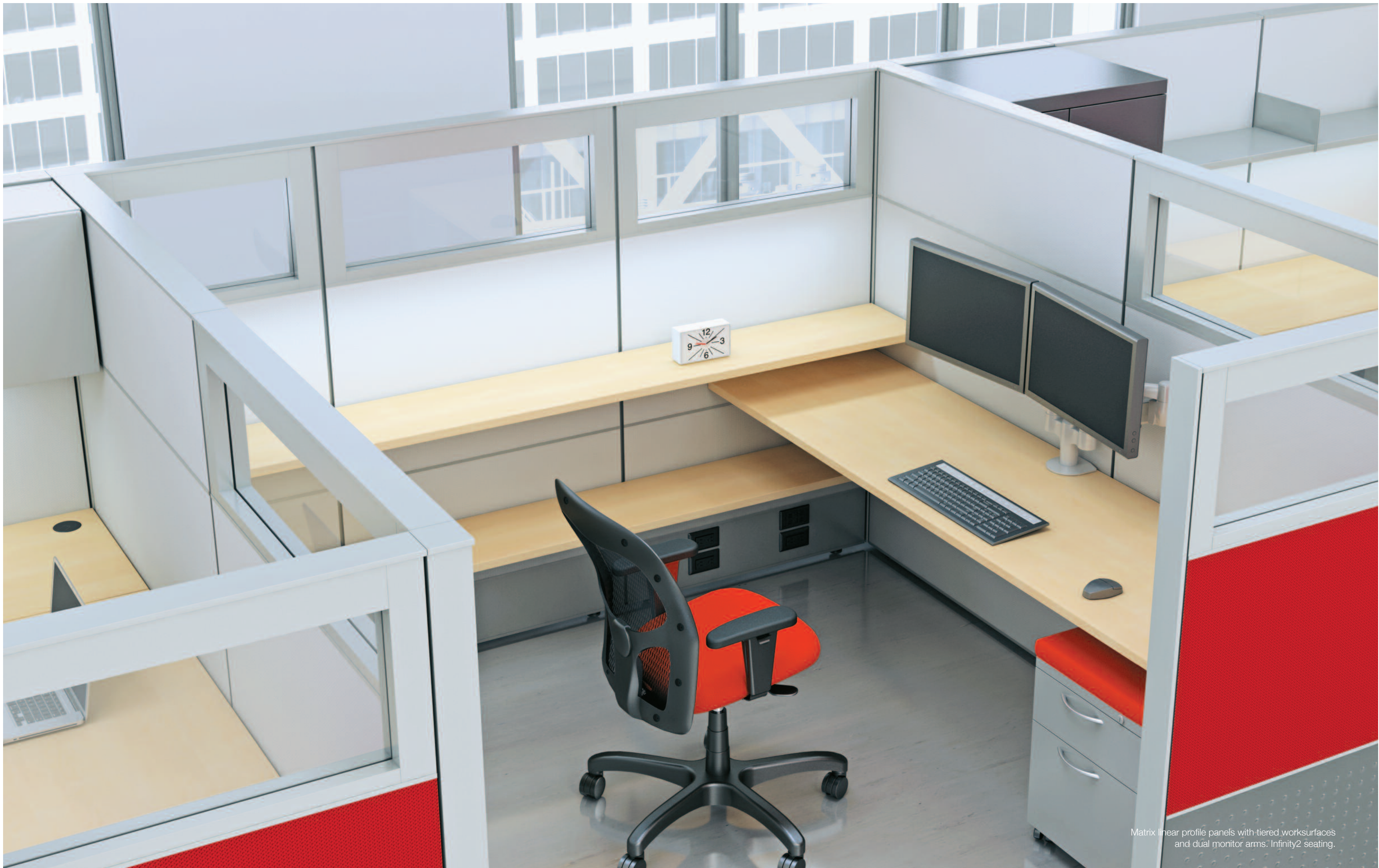
Matrix linear profile panels with tiered worksurfaces and dual monitor arms. Infinity2 seating.