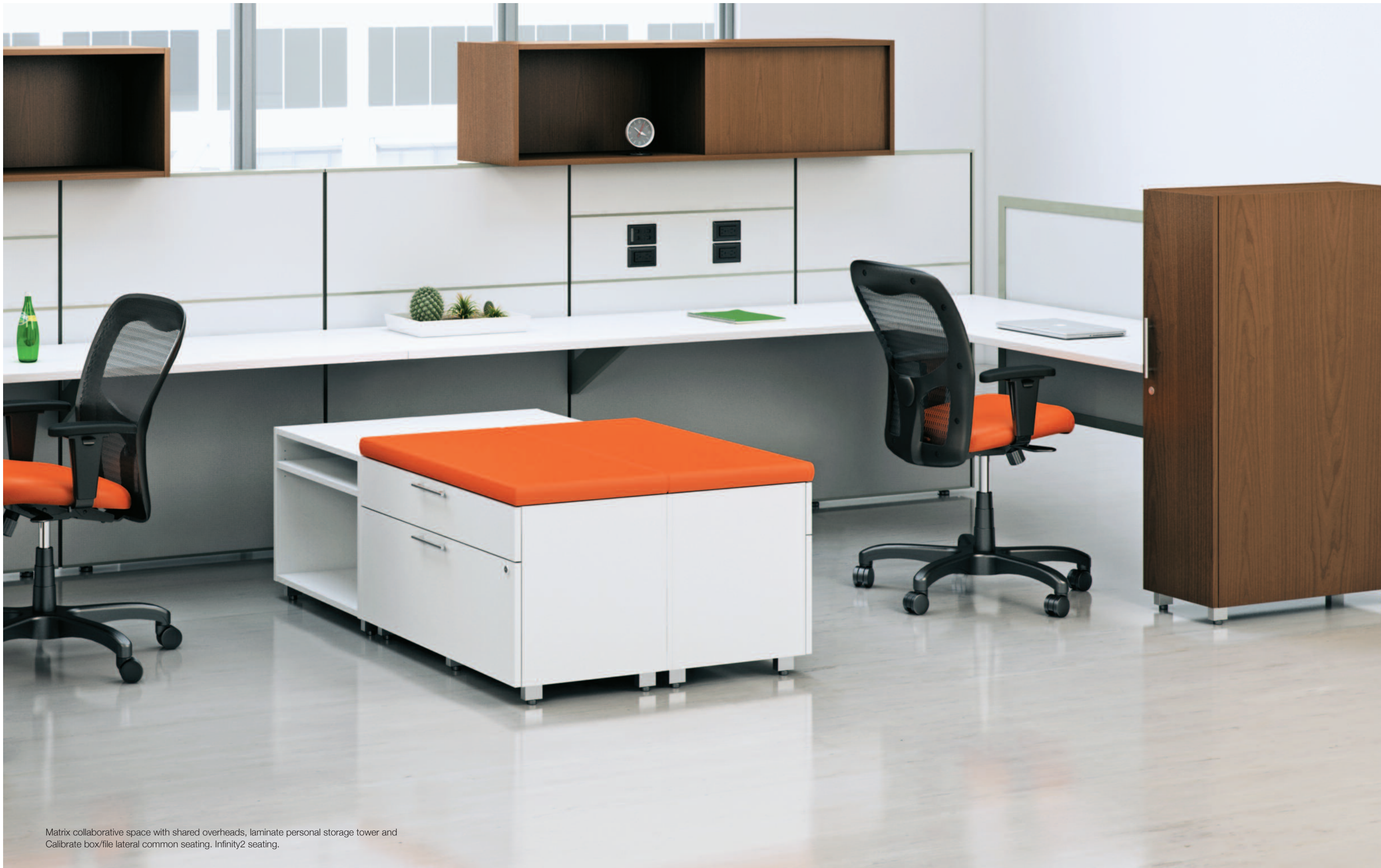
Matrix collaborative space with shared overheads, laminate personal storage tower and Calibrate box/file lateral common seating. Infinity2 seating.