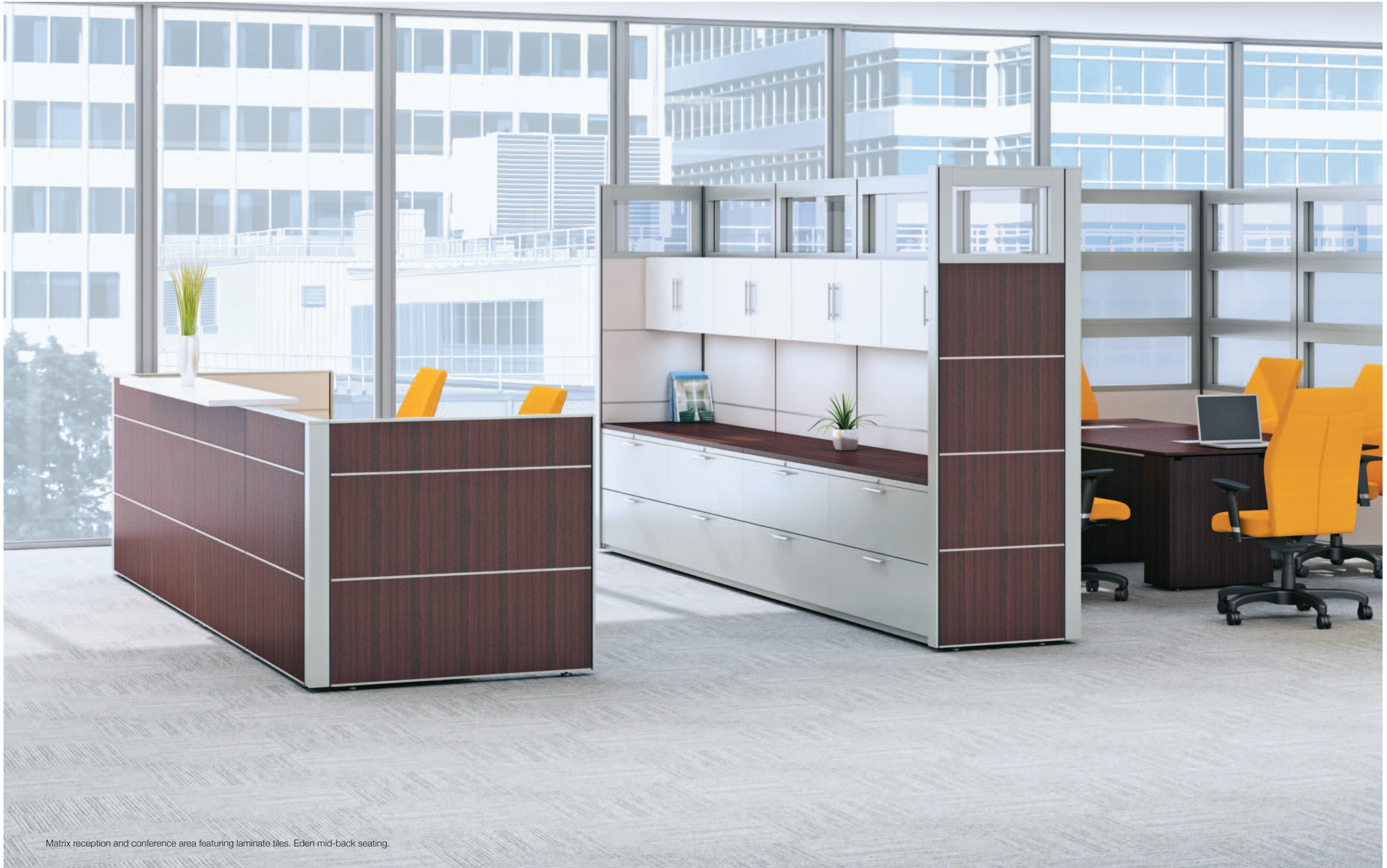
Matrix reception and conference area featuring laminate tiles. Eden mid-back seating.