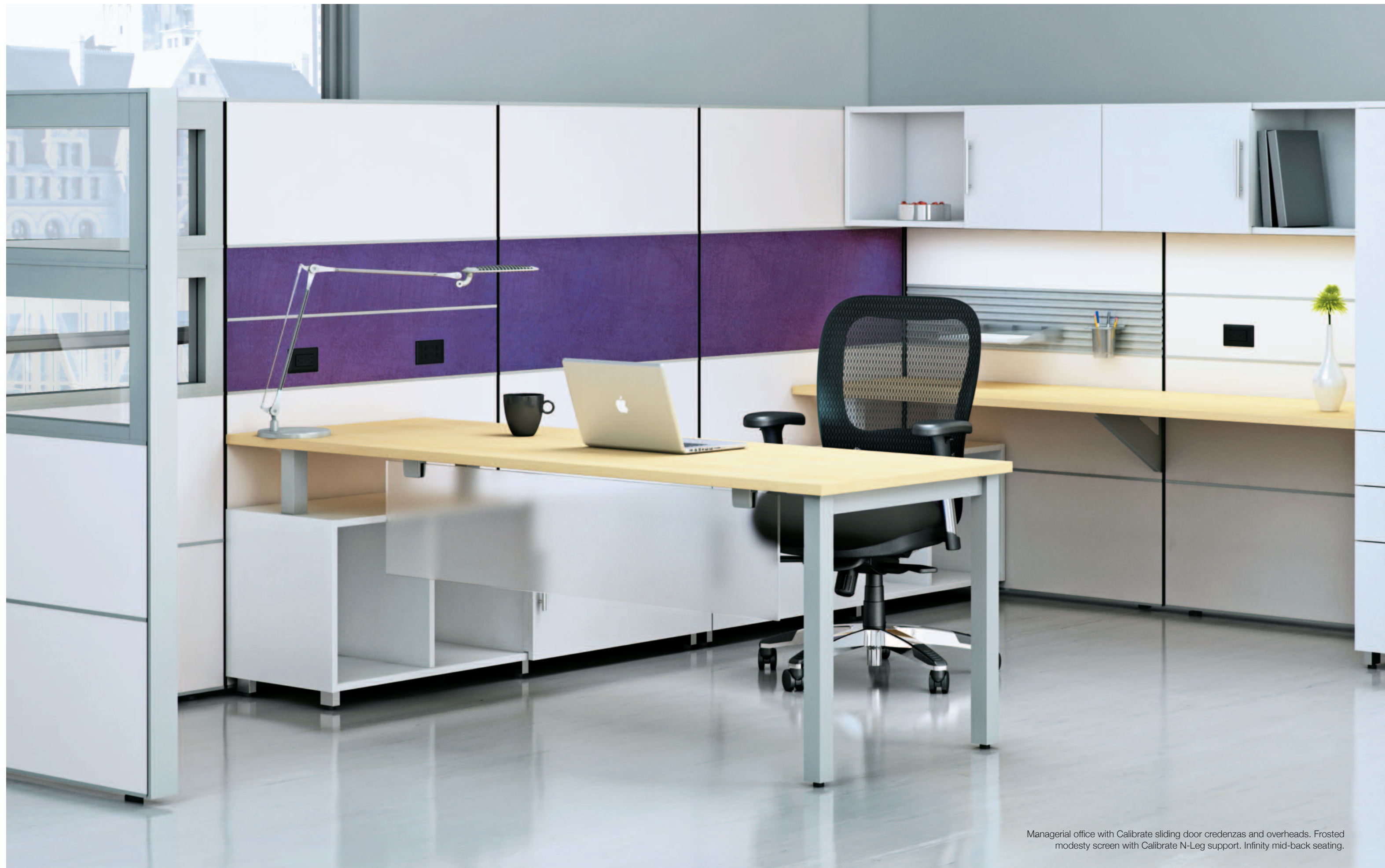
Managerial office with Calibrate sliding door credenzas and overheads. Frosted modesty screen with Calibrate N-Leg support. Infinity mid-back seating.